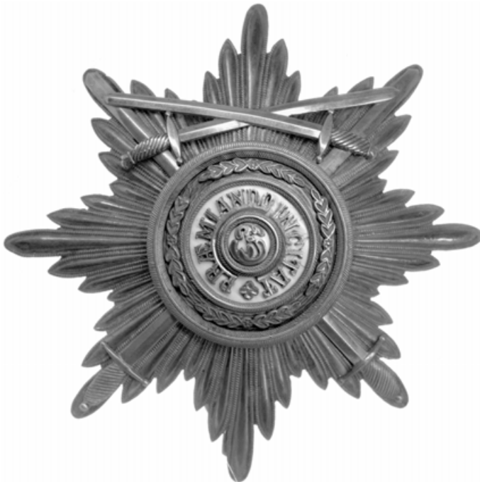
243 Order of St. Stanislaus , Military Division, breast star, by Eduard of St. Petersburg, workmaster IL, 1908-17, breast star, in silver, with gilt and enamel centre, gilt swords and gilt reverse, 89 mm., with later, unofficial 'surmounted' additional swords, extremely fine £600-800